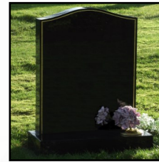
Lawn Headstone Memorial

I would like to apply for the Exclusive Right of Burial in the following cemetery: