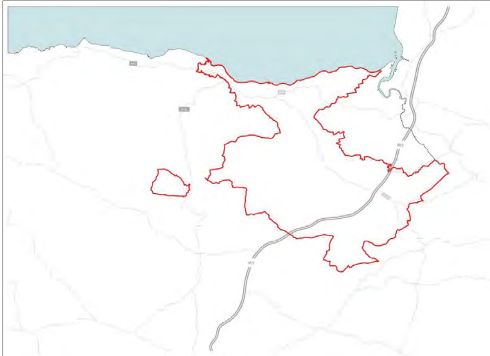
Figure 1. LDO Boundary Plan.