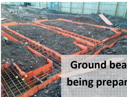
Ground beam being prepared