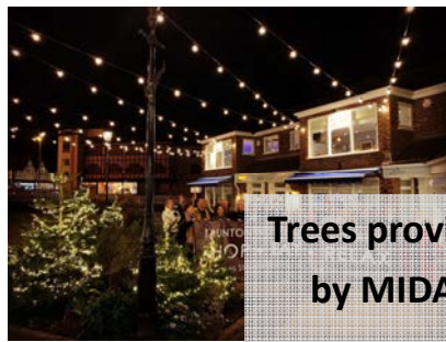
Trees provided by MIDAS