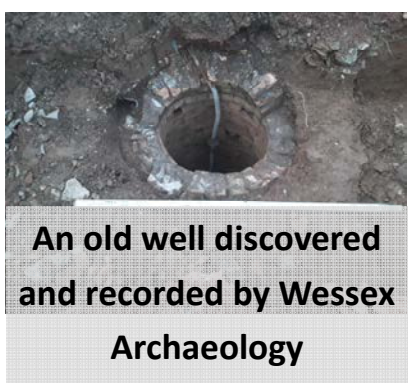
An old well discovered and recorded by Wessex Archaeology