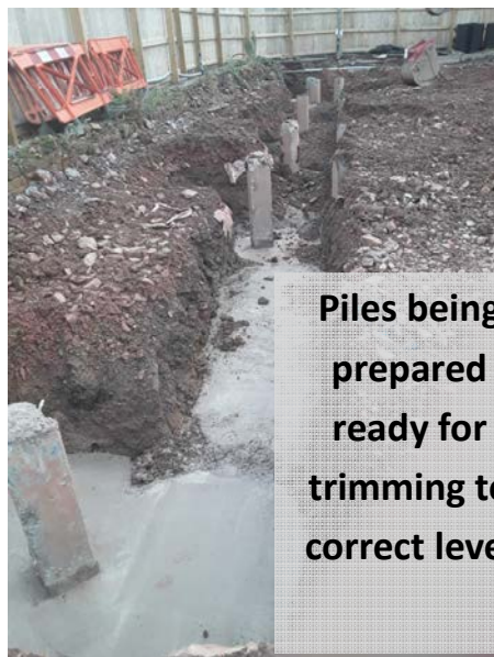
Piles being prepared ready for trimming to correct level