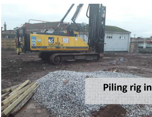
Piling rig in action